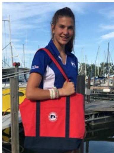
Lady's Sophisticated Polo – Gentle Contour Silhouette, Sharp White Detailing, Very Flattering!!! Cool 100% Polyester, Moisture Wicking SSC Logo on Left Chest, SSC Flags on Right Upper Arm Sizes: Small to X-Large Price: $32.50