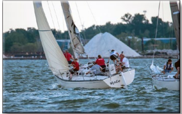
White Cap heads to weather on a Wednesday Night race.

www.harbornorth.com • email: boating@harbornorth.com