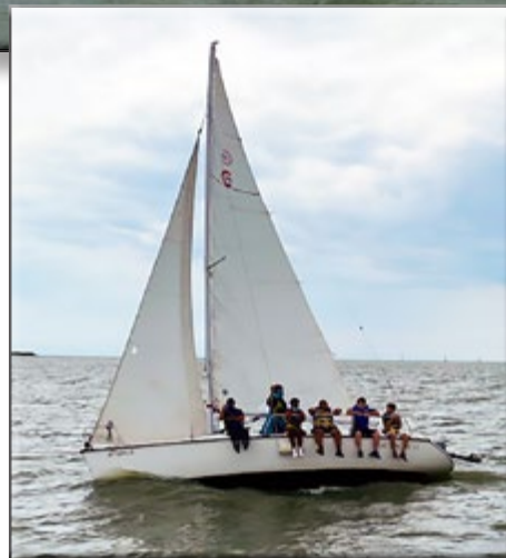
Left: Learn to Sail youth are hiking hard on the rail of Deal with the Devil.