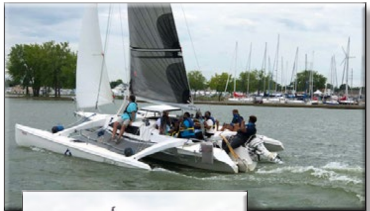
Above: KanZa cruises past the Sailing Club.

Wednesday night racing courses - The new Wednesday auxiliary courses/sailing instructions are printed and at the club. Don't forget to get your copy so you know the courses. They are new (actually old) courses using fixed marks in the bay.