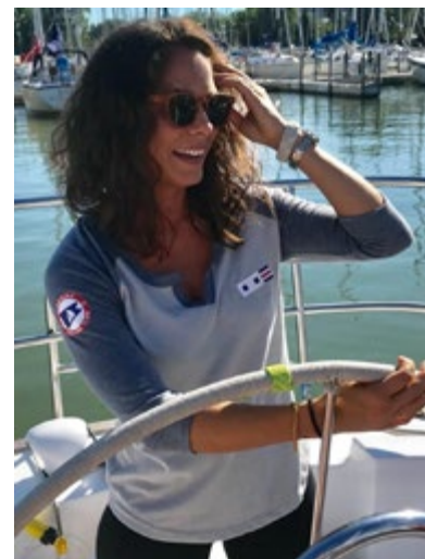
Women's Vintage T-Shirt – Extra Sporty, ¾ Length Sleeves Silver Body with Soft Navy Detail, Curved Shirrtail Hem for Graceful Fit 50/50 Cotton/Polyester SSC Flags on Left Chest, SSC Logo on Right Upper Arm Sizes: Small to X-Large Price: $20.00