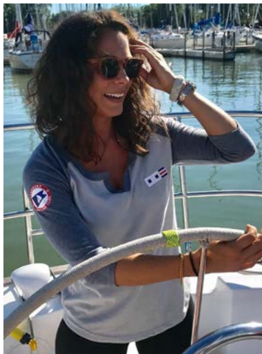
Women's Vintage T-Shirt — Extra Sporty, ¾ Length Sleeves Silver Body with Soft Navy Detail, Curved Shirrtail Hem for Graceful Fit 50/50 Cotton/Polyester SSC Flags on Left Chest, SSC Logo on Right Upper Arm Sizes: Small to X-Large Price: $20.00