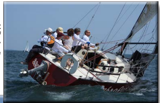
Jolimon won the Sandusky Islands Race Cruising Class and was only two minutes off in his predicted finish time.