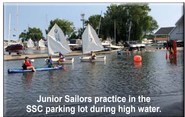
Junior Sailors practice in the SSC parking lot during high water.