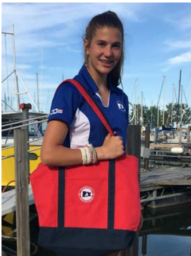
Lady's Sophisticated Polo — Gentle Contour Silhouette, Sharp White Detailing, Very Flattering!!! Cool 100% Polyester, Moisture Wicking SSC Logo on Left Chest, SSC Flags on Right Upper Arm Sizes: Small to X-Large Price: $32.50

Don't forget to pick up your awards — Members can to pick up their awards from last fall's Awards Banquet at the Dairy Bar. Please do so ASAP.