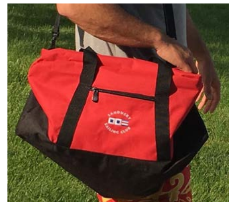
Duffel Bag — Heavy Duty Polyester with Adjustable Shoulder Strap, Top and Side Grip Handles, Front Zippered Pocket Red and Black with SSC Flags on Front Size: 22" x 11" x 10 ½" Price: $25.00