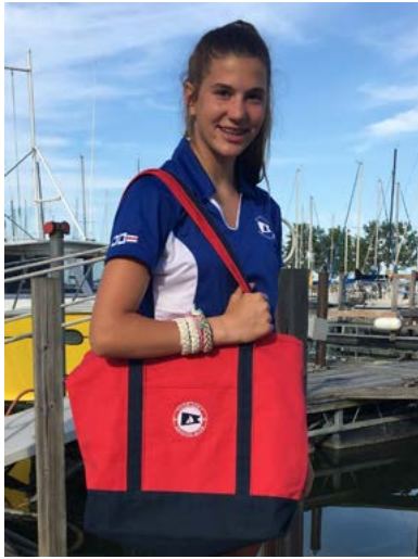
Lady's Sophisticated Polo – Gentle Contour Silhouette, Sharp White Detailing, Very Flattering!!! Cool 100% Polyester, Moisture Wicking SSC Logo on Left Chest, SSC Flags on Right Upper Arm Sizes: Small to X-Large Price: $32.50