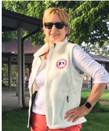
Women's Vest – Crisp Winter White, Front Zippered Pockets for Adjustable Hem Super Soft 100% Polyester SSC Logo on Left Chest Sizes: Small to X-Large Price: $29.00