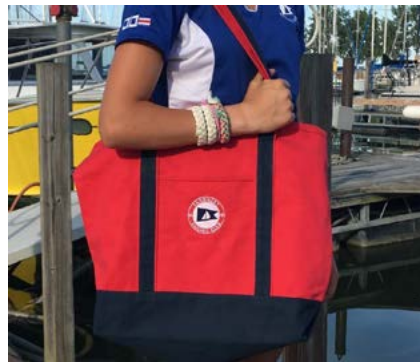
Beach Tote – Outside Pocket and Velcro Closure at Top 100% Cotton Canvas Red with Navy Bottom and Straps, SSC Logo on Front Size: 21 ½" x 15 ½" x 6 ½" Price: $20.00