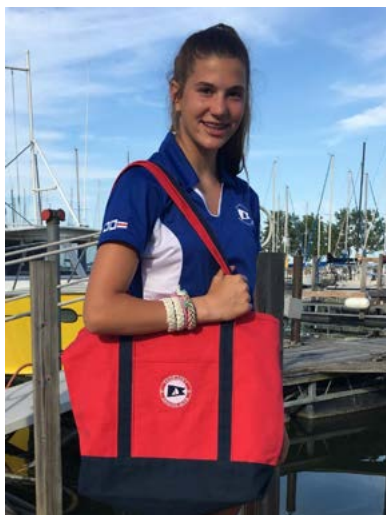
Lady's Sophisticated Polo – Gentle Contour Silhouette, Sharp White Detailing, Very Flattering!!! Cool 100% Polyester, Moisture Wicking SSC Logo on Left Chest, SSC Flags on Right Upper Arm Sizes: Small to X-Large Price: $32.50