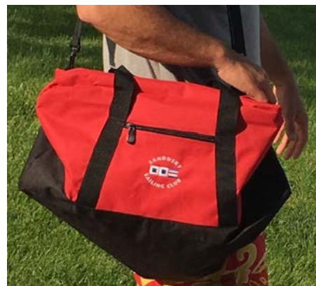
Duffel Bag – Heavy Duty Polyester with Adjustable Shoulder Strap, Top and Side Grip Handles, Front Zippered Pocket Red and Black with SSC Flags on Front Size: 22" x 11" x 10 ½" Price: $25.00