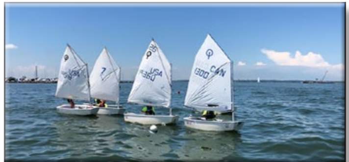
Sandusky Junior Sailors practice racing techniques on the bay in front of the club.

Website upgrades are done and we are working through an issue that has email blasts going only to the primary email address. Aside from the email issue, you will also notice it has a mobile version of the website that is very user friendly on your phone. If you have website issues, send an email to webmaster@sanduskysailingclub.com for assistance. You should also send announcements you want sent out to the membership to the same email address. The Club Calendar will be kept up to date with bar hours and the events that are sent to the webmaster to post, so if you don't see an event on the calendar, you know why.