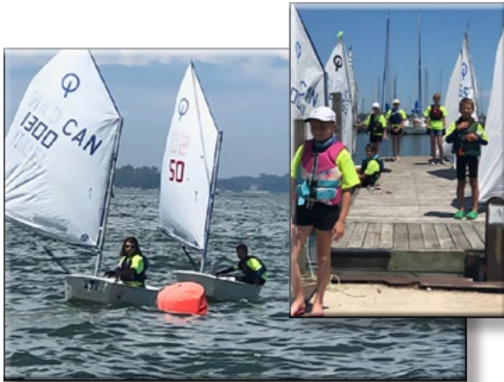
Sandusky Junior Sailors having FUN at SSC.