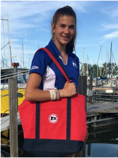
Lady's Sophisticated Polo – Gentle Contour Silhouette, Sharp White Detailing, Very Flattering!!! Cool 100% Polyester, Moisture Wicking SSC Logo on Left Chest, SSC Flags on Right Upper Arm Sizes: Small to X-Large Price: $32.50