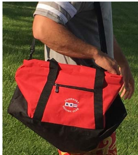
Duffel Bag – Heavy Duty Polyester with Adjustable Shoulder Strap, Top and Side Grip Handles, Front Zippered Pocket Red and Black with SSC Flags on Front Size: 22" x 11" x 10 ½" Price: $25.00