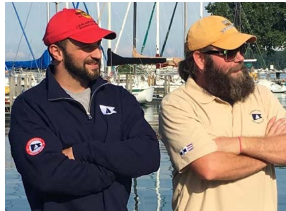
Unisex Quarter Zip Sweatshirt – Soft and Cuddly 50/50 Cotton/Polyester, Won't Shrink SSC Burgee on Left Chest, SSC Logo on Right Upper Arm Sizes: Small to X-Large Price: $32.00