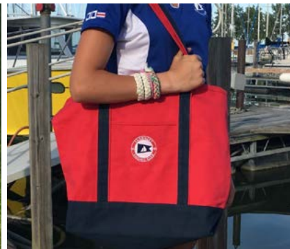
Beach Tote – Outside Pocket and Velcro Closure at Top 100% Cotton Canvas Red with Navy Bottom and Straps, SSC Logo on Front Size: 21 ½" x 15 ½" x 6 ½" Price: $20.00