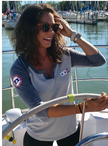
Women's Vintage T-Shirt – Extra Sporty, ¾ Length Sleeves Silver Body with Soft Navy Detail, Curved Shirrtail Hem for Graceful Fit 50/50 Cotton/Polyester SSC Flags on Left Chest, SSC Logo on Right Upper Arm Sizes: Small to X-Large Price: $20.00