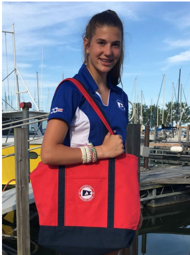
Lady's Sophisticated Polo – Gentle Contour Silhouette, Sharp White Detailing, Very Flattering!!! Cool 100% Polyester, Moisture Wicking SSC Logo on Left Chest, SSC Flags on Right Upper Arm Sizes: Small to X-Large Price: $32.50