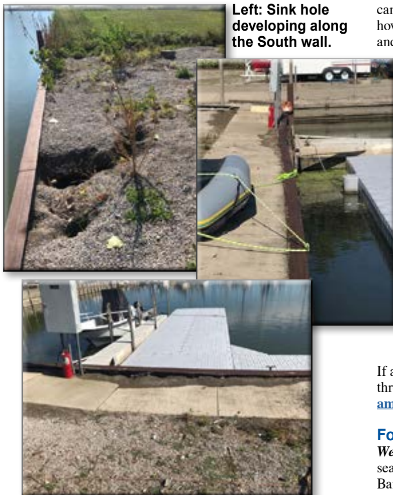
Left: Sink hole developing along the South wall.

South wall project - The steel has been ordered and we are progressing with the wall repair this off season. All boats were