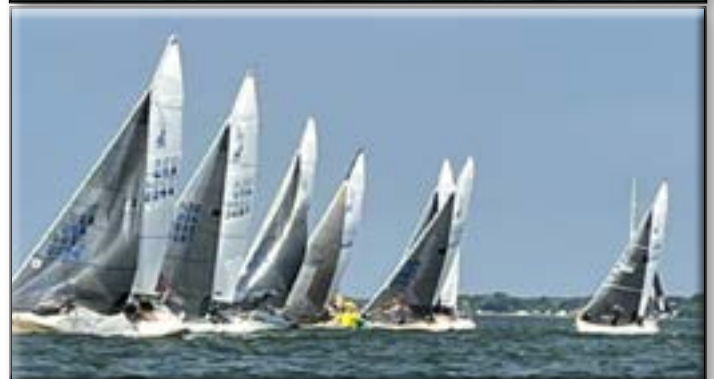
The J/24 class had a good turnout for its 2022 Great Lakes Championships at SSC. They had great wind and competitive sailing.